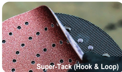
Super-Tack (Hook & Loop)